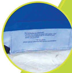
ACCUMAX QUANTUM PC AIR-PORT